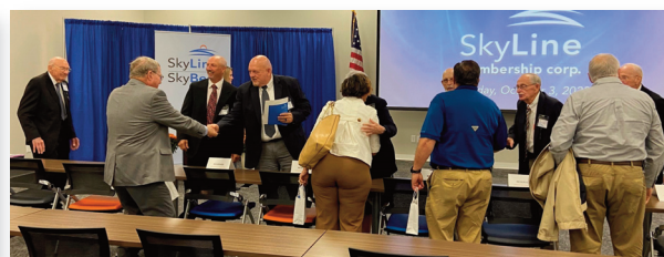
Following the Annual Membership Meeting, Board members greeted those in attendance on October 3.