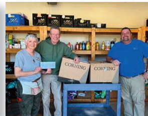
Solid Rock Food Closet (Alleghany)