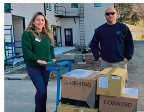
Hunger and Health Coalition (Watauga)