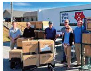
Ashe Food Pantry (Ashe)