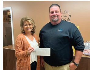
Reaching Avery Ministry (Avery)

With North Carolina ranked in the top 10 of food-insecure states in the nation, a worrisome statistic only further exacerbated by the pandemic, the state's food pantries have reported a 35 percent increase in need during this time. That's why this important drive brings immediate relief to area families and helps to restock area pantry shelves and replenish backpack initiatives. We are so grateful for the outpouring of support by our members, customers, SkyLine board/staff, our dedicated members and customers, and the community! Thank you for continuing to share your gifts of food and resources to address this pressing local need.